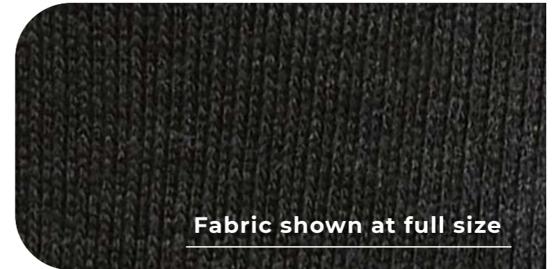
Fabric shown at full size